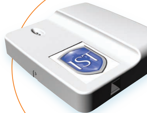
The Award-Winning IST Monitor

The IST can communicate to our server through a VOIP, cellular or telephone modem, meaning no matter where your equipment is – in a hospital or mobile medical vehicle – your equipment is dependably monitored 24/7/365.